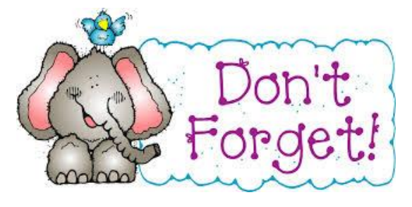
Families should read the handbook in its entirety.